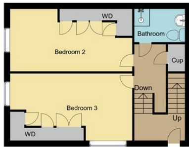
Ground Floor 42Sq.m/452.61Sq.ft approx.