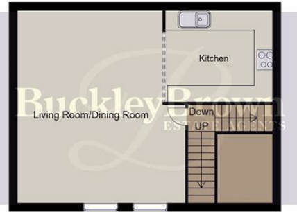
First Floor 45Sq.m/487.10Sq.ft approx.